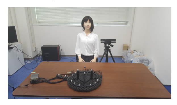
Figure 1: The setup of ERICA's demonstration system, with microphone array and Kinect sensor.

A Kinect sensor is placed beside ERICA to track the position and attention of users to control ERICA's eye gaze behavior. The system architecture is shown in Figure 2. Multimodal synchronization is implemented to accurately combine the audio and motion data. ERICA's spoken utterances are managed through a text-to-speech engine which enables her to speak natural utterances as well as backchannels and even laughs.