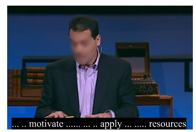
Figure 1. Screenshot of PSC on a TED talk made from the original transcript "how we motivate people how we apply our human resources"

With the purpose of providing adequate textual assistance to L2 listeners while encouraging them to use their listening skills, this study introduces a new method of captioning, partial and synchronized captioning (Figure 1).