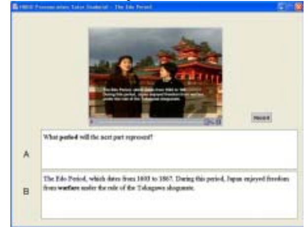
Figure 1 Screenshot of role-play session

want students to focus on the flow of the conversation. Instead, we added pronunciation models and a dictionary function for difficult words to facilitate the practice.